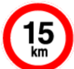
QUAY AND WAREHOUSE